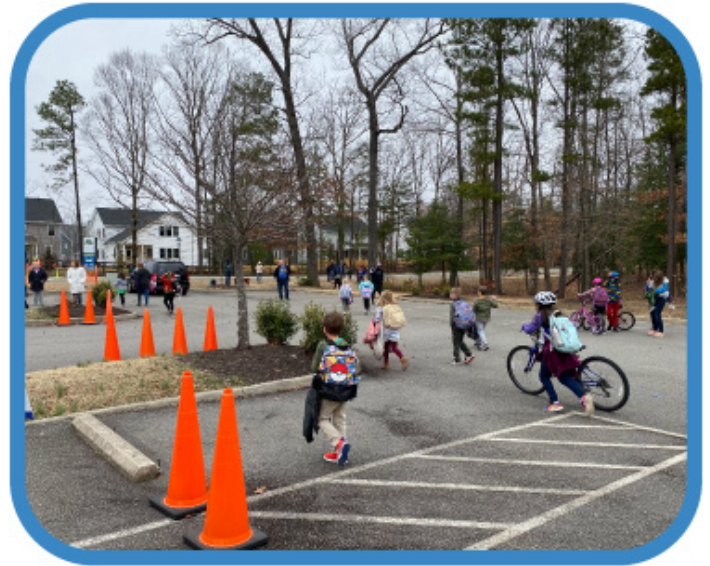
Students walking and bicycling during dismissal at Cool Spring Elementary School.