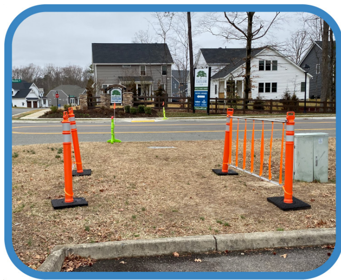
This fencing directs students to a place where they can safely cross the street.

We partnered with parents and members of Bike Walk Hanover to identify immediate needs that would enhance safety for our students who choose to bike and walk to school, and to submit the grant. We were able to purchase safety fencing, crossing signs, crossing flags, and signage to alert drivers to our bikers and walkers. We also used the funding to purchase an additional bike rack to increase our capacity for bike parking.