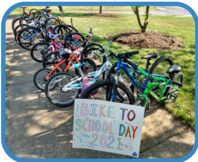
Keister Elementary School, Harrisonburg