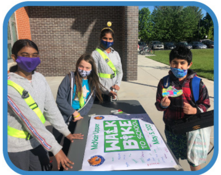
McNair Upper Elementary School, Herndon