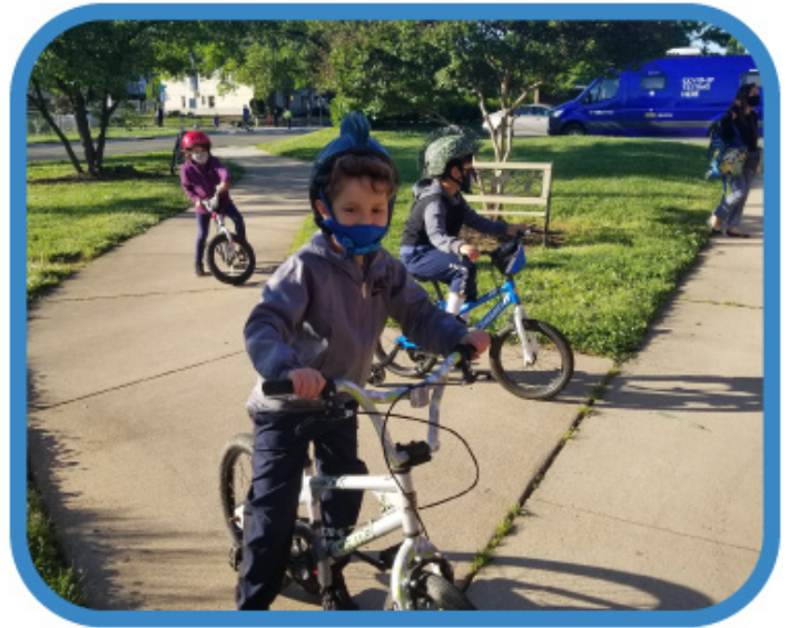
Cora Kelly School, Alexandria